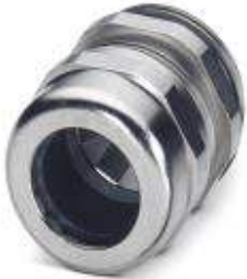
Cable gland, Cable gland material: Brass, nickel-plated, External cable diameter 24 mm ... 35 mm, Shielding: yes, Connecting thread: M50, Color: silver

Please be informed that the data shown in this PDF Document is generated from our Online Catalog. Please find the complete data in the user's documentation. Our General Terms of Use for Downloads are valid ( http://phoenixcontact.com/download )