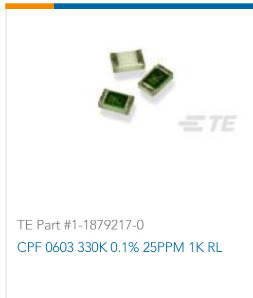
TE Part #1-1879217-0 CPF 0603 330K 0.1% 25PPM 1K RL