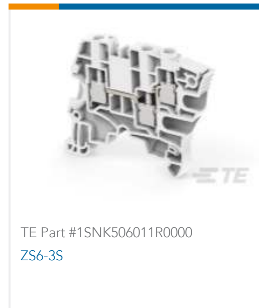
TE Part #1SNK506011R0000 ZS6-3S