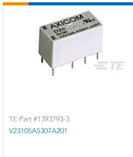
TE Part #1393793-3 V23105A5307A201