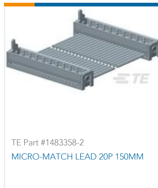
TE Part #1483358-2 MICRO-MATCH LEAD 20P 150MM