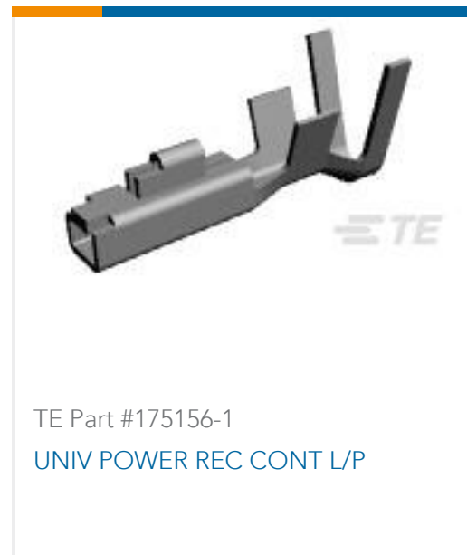
TE Part #175156-1 UNIV POWER REC CONT L/P