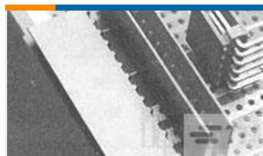
TE Part #281698-5 HEADER HE14 RA 5 P