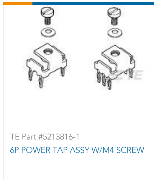
TE Part #5213816-1 6P POWER TAP ASSY W/M4 SCREW