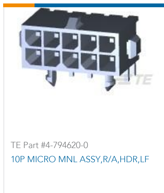
TE Part #4-794620-0 10P MICRO MNL ASSY,R/A,HDR,LF