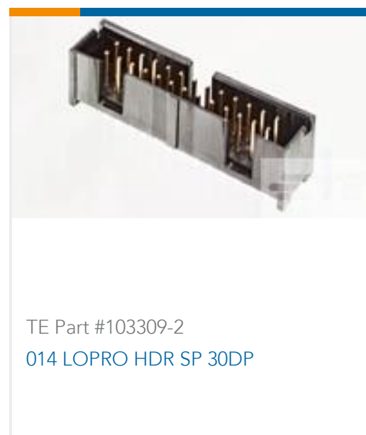
TE Part #103309-2 014 LOPRO HDR SP 30DP