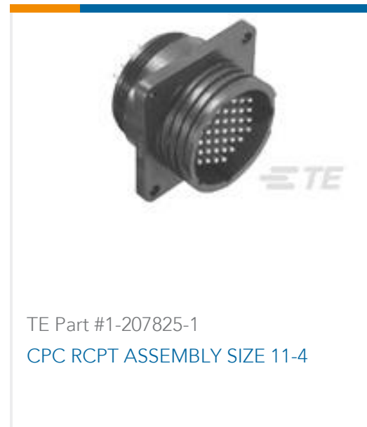
TE Part #1-207825-1 CPC RCPT ASSEMBLY SIZE 11-4