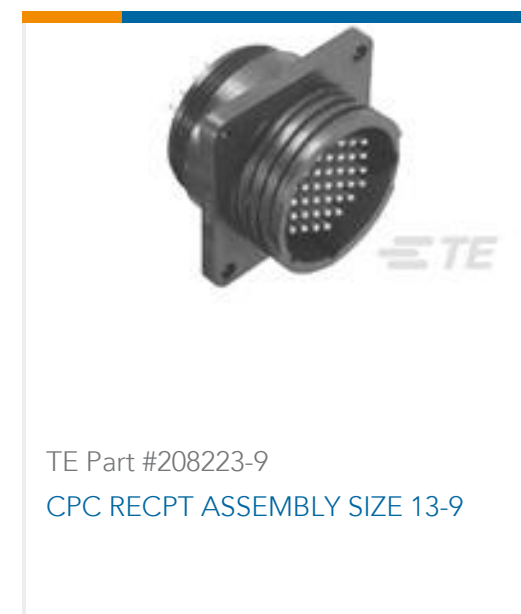
TE Part #208223-9 CPC RCPT ASSEMBLY SIZE 13-9