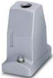
HEAVYCON ADVANCE EMV sleeve housing B6, with screw locking, height 100 mm, with 1xM20 thread, straight cable outlet

Please be informed that the data shown in this PDF Document is generated from our Online Catalog. Please find the complete data in the user's documentation. Our General Terms of Use for Downloads are valid ( http://download.phoenixcontact.com )