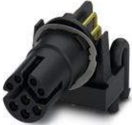
M12 panel feed-through, rear mounting

Hybrid contact carrier, Ethernet, 8-pos., rear/screw mounting, with angled solder connection