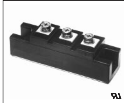
CD411260, CD411660 Dual Diode POW-R-BLOK™ Modules 60 Amperes/1200-1600 Volts