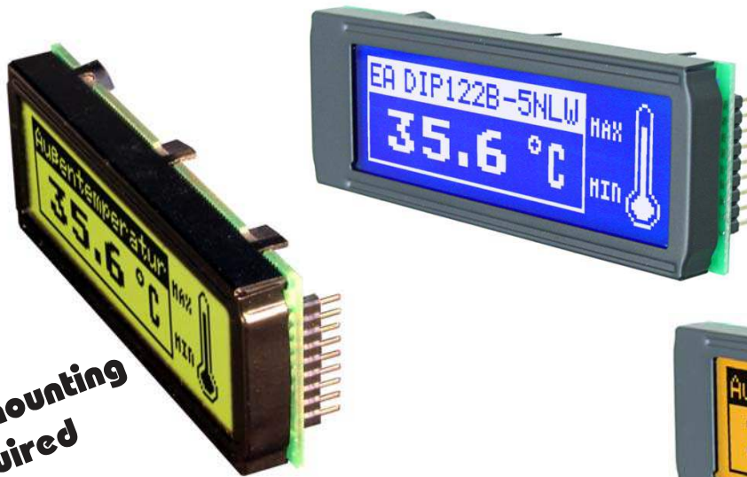
blue-white: EA DIP122B-5NLW Dimension 75 x 27 mm