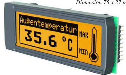
amber: EA DIP122J-5NLA Dimension 75 x 27 mm