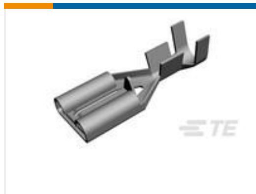
TE Part #1217094-2 RCPT 250 POS-LOCK 18-14 TPBR