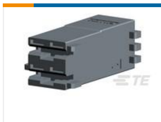
TE Part #521204-2 HSG RCPT POSI MK 111 250 2POS