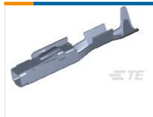
TE Part #7-1452656-2 MCON 1.2 LL REC SRC AU