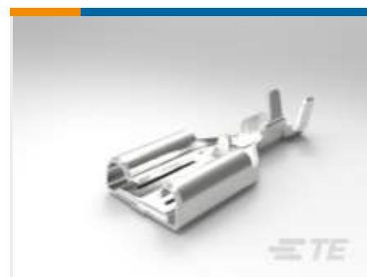
TE Part #2238136-2 RECEPTACLE, POSITIVE-LOCK, RAST 6.35