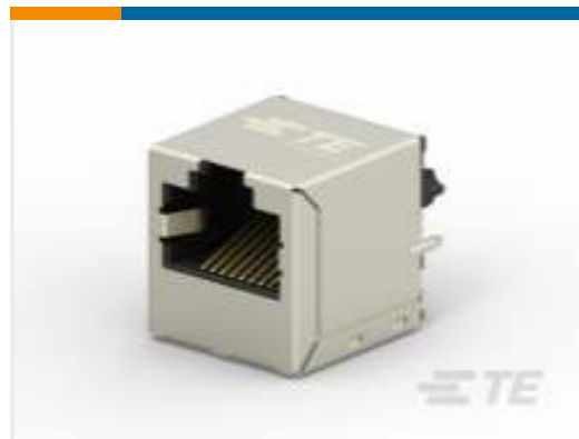
TE Part #2301995-1 RJ45 JACK INT.MAG. 1GB 1X1 VERT.