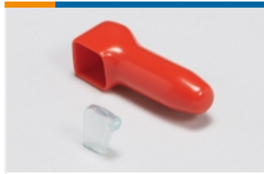
Insulation Boots & Sleeves(7)