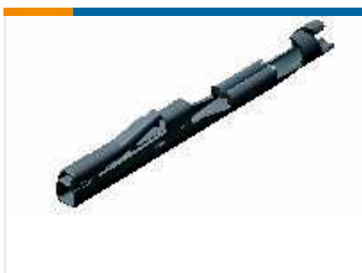
TE Part #2-1703930-2 NANOMQS, RECEPTACLE TERMINAL