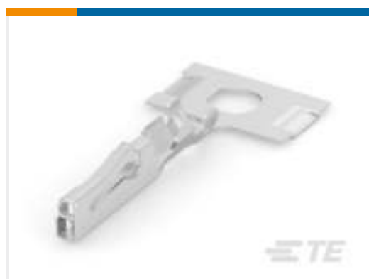
TE Part #2-2287720-1 Pico MQS Terminals