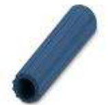
Insulating sleeve, Color: blue