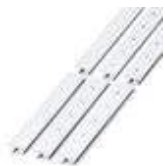
Zack marker strip, Can be ordered: Strip, white, Labeled according to customer specifications, Mounting type: Snap into tall marker groove, For terminal block width: 16.3 mm, Lettering field: 10.5 x 16.25 mm