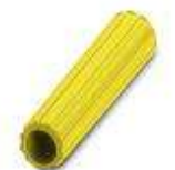
Insulating sleeve, Color: yellow