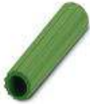
Insulating sleeve, Color: green