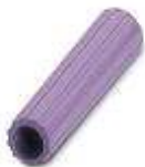
Insulating sleeve, Color: violet