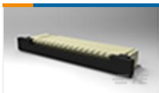
TE Part # 2-84953-3 1MM FPC HORZ.TOP CONT.ASSY 23P