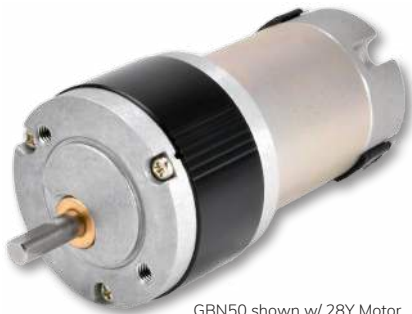
GBN50 shown w/ 28Y Motor