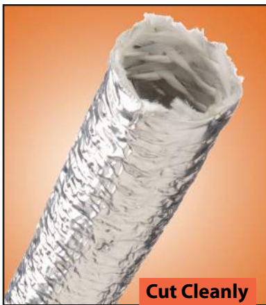
Cut Cleanly Scissor