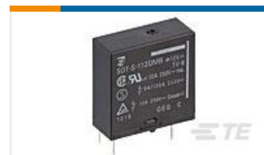
TE Part #8-1419125-5 SDT-S-106LMR,000