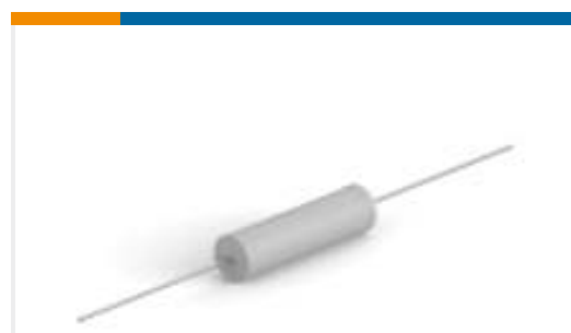
TE Part #4-2176414-8 7W STD M/OX 5% 1K8