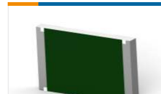
TE Part #8-2176407-8 3560 27R 5%