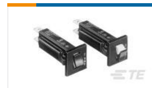
TE Part #1-1393250-7 W28-XQAT-15=W28