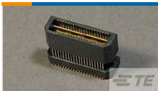
TE Part # 1-1658437-1 MSB0.80PL14ASY28DP,-,F,VCTY