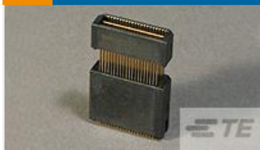
TE Part # 1-1658051-1 MSB0.80PL30ASY28DP,-,F,VCTY