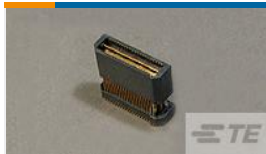
TE Part # 1-1658048-1 MSB0.80PL19ASY28DP,-,F,VCTY