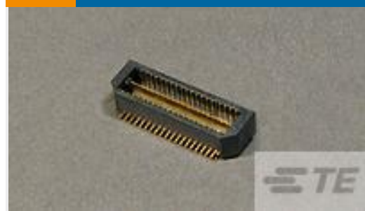
TE Part # 1-1658044-1 MSB0.80PL5ASY28DP,-,F,VCTY