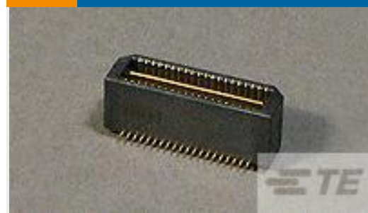
TE Part # 1-1658045-1 MSB0.80PL8ASY28DP,-,F,VCTY