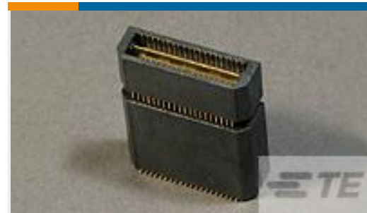
TE Part # 1-1658050-1 MSB0.80PL25ASY28DP,-,F,VCTY