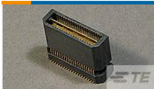
TE Part # 1-1658047-1 MSB0.80PL16ASY28DP,-,F,VCTY