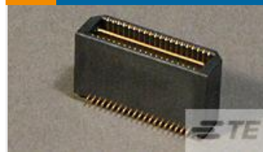
TE Part # 1-1658046-1 MSB0.80PL11ASY28DP,-,F,VCTY