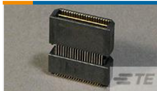
TE Part # 1-1658049-1 MSB0.80PL22ASY28DP,-,F,VCTY