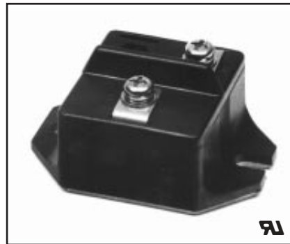
CS240610, CS241210 Fast Recovery Single Diode Modules 100 Amperes/600-1200 Volts