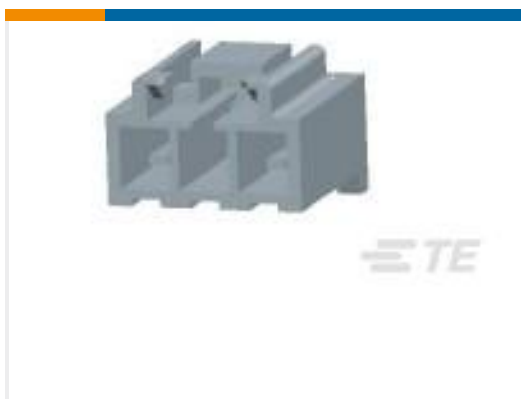
TE Part #3-176976-4 UNIV.POWER HDR ASSY 3P