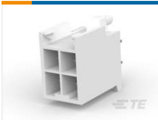
TE Part #179846-1 STD Temp Power Double Lock Header