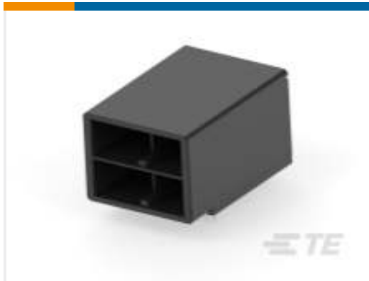
TE Part #1-353081-2 Header Assembly: Wire-to-Board, 20-45A, 250-630V