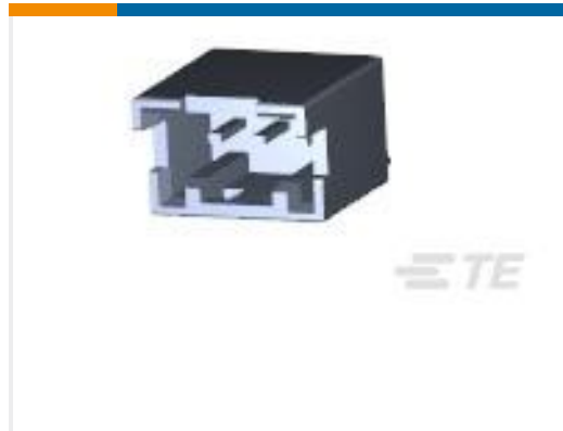
TE Part #1871843-3 GIC 2.5 HDR ASSY TIN VERSION 3P