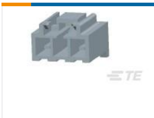
TE Part #3-176976-2 UNIV POWER HDR ASSY 3P RED