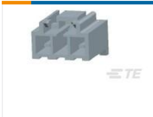
TE Part #3-176976-6 UNIV POWER HDR ASSY 3P BLUE