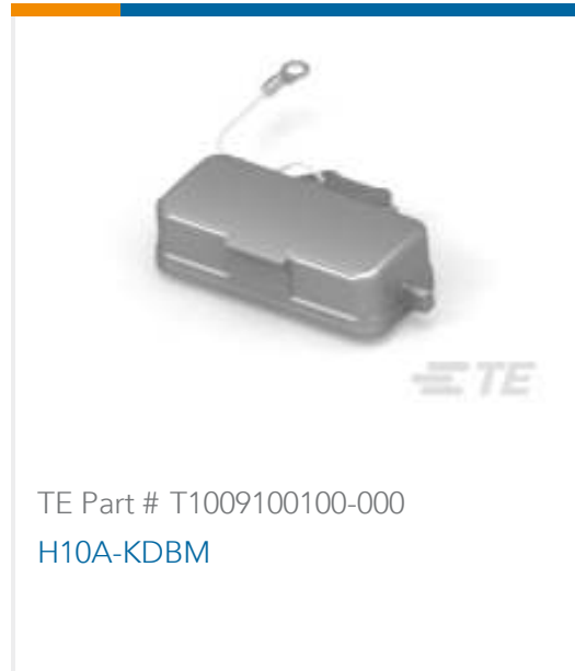
TE Part # T1009100100-000 H10A-KDBM