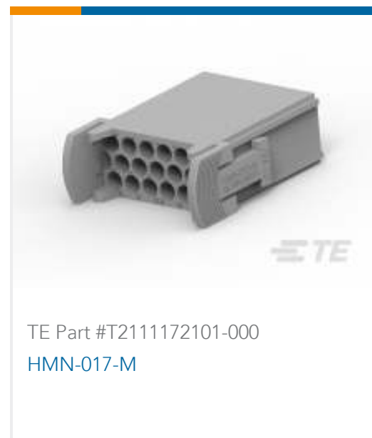
TE Part # T2111172101-000 HMN-017-M