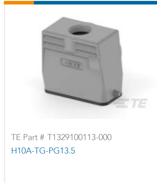
TE Part # T1329100113-000 H10A-TG-PG13.5