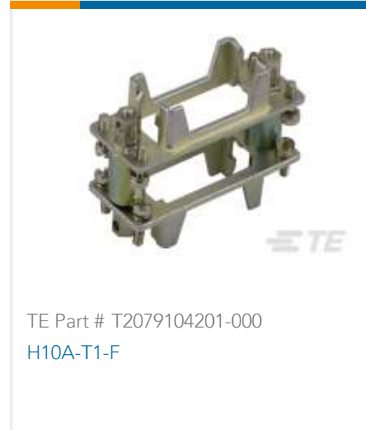
TE Part # T2079104201-000 H10A-T1-F