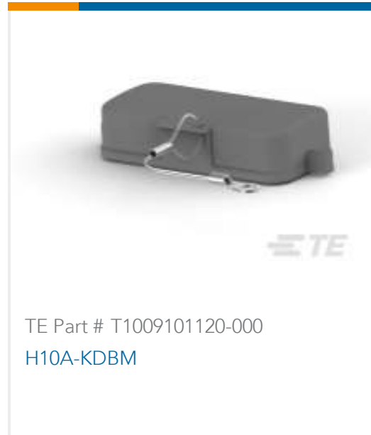
TE Part # T1009101120-000 H10A-KDBM