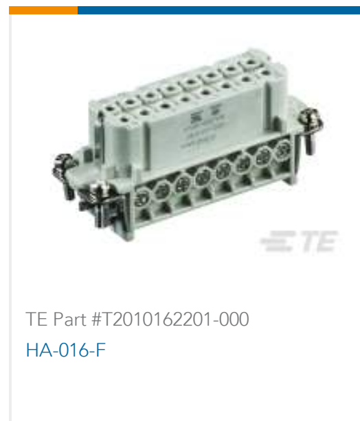
TE Part # T2010162201-000 HA-016-F