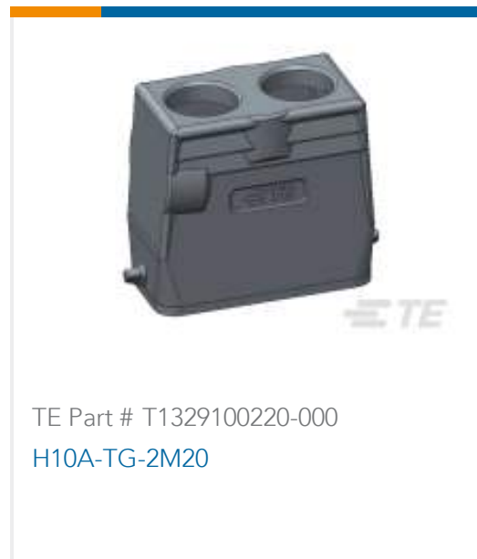
TE Part # T1329100220-000 H10A-TG-2M20