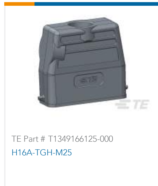
TE Part # T1349166125-000 H16A-TGH-M25