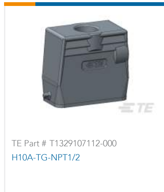
TE Part # T1329107112-000 H10A-TG-NPT1/2