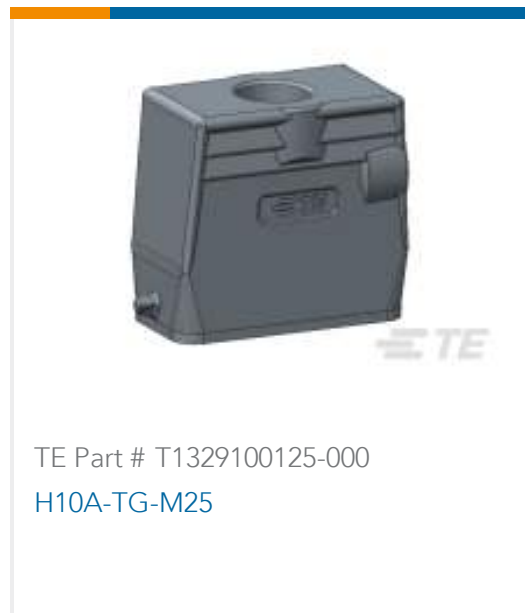
TE Part # T1329100125-000 H10A-TG-M25