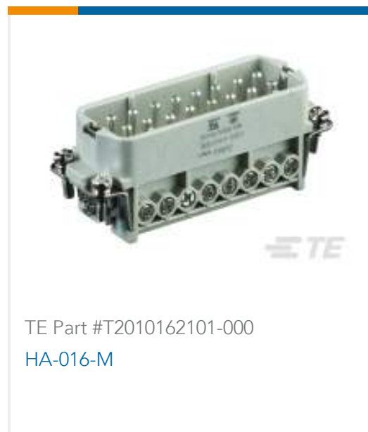
TE Part # T2010162101-000 HA-016-M