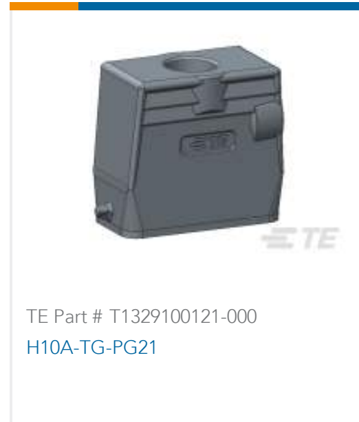
TE Part # T1329100121-000 H10A-TG-PG21