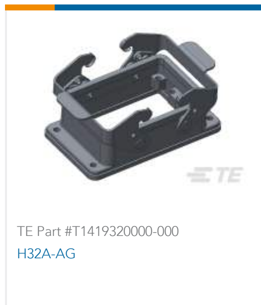
TE Part # T1419320000-000 H32A-AG