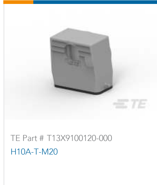
TE Part # T13X9100120-000 H10A-T-M20