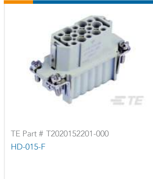
TE Part # T2020152201-000 HD-015-F