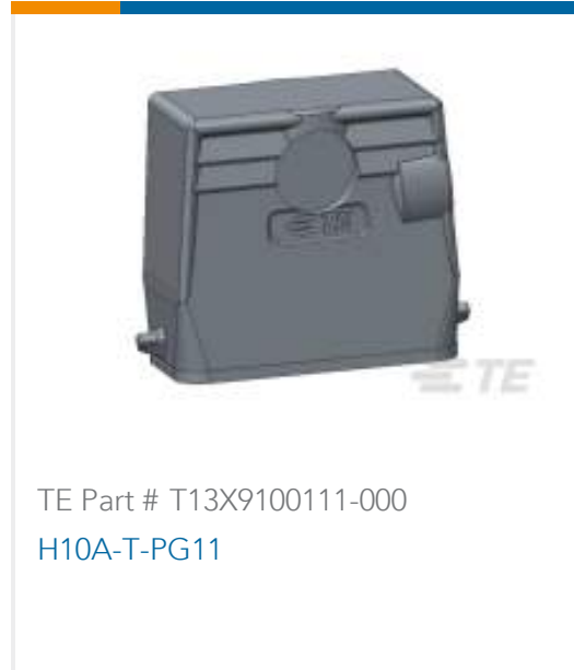
TE Part # T13X9100111-000 H10A-T-PG11