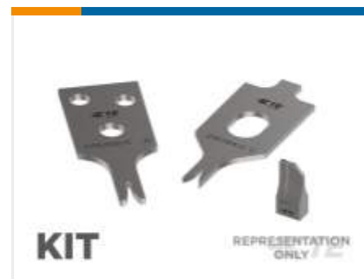
TE Part # 7-2150069-7 OCEAN_2.0_SPARE_PART_KIT-120F180F