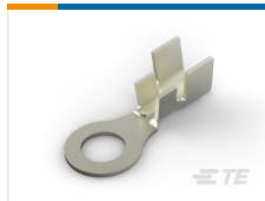
TE Part # 41332-1 RING TERMINAL 18-14 AWG NPST