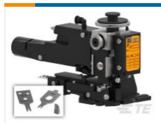
TE Part # 7-2150069-2 OCEAN_2.0_Applicator-E-120F180F