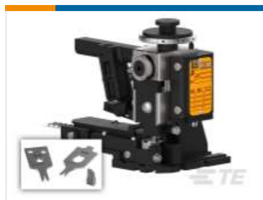
TE Part # 7-2150069-1 OCEAN_2.0_Applicator-E-120F180F