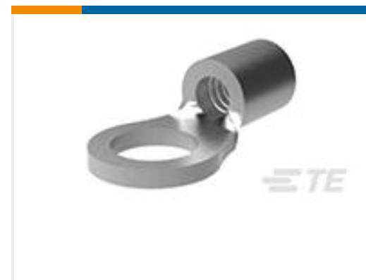
TE Part #34107-1 TERMINAL, SOLIS R 22-16 6