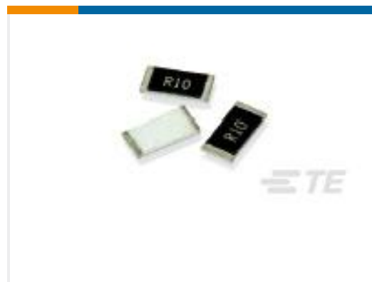
TE Part #4-2176058-2 RLP73K 3A R51 5% 2K RL