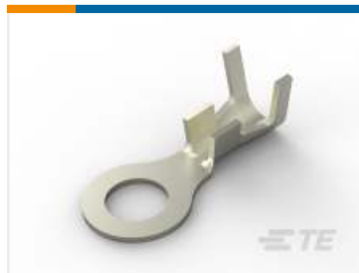
TE Part # 485003-1 RING 22-18 AWG 0.0195 X 0.5 NPST