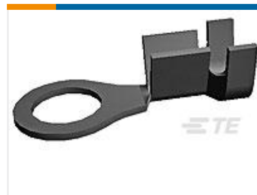
TE Part #40594 RING TERMINAL 18-14 AWG TPBR