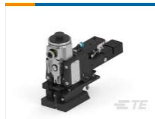
TE Part # 2150069-1 OCEAN_2.0_Applicator-E-120F180F