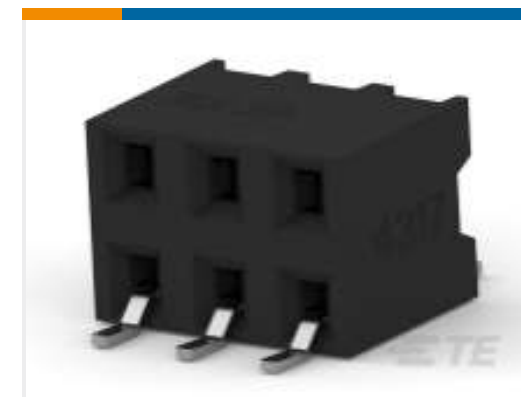
TE Part #2307729-6 6P, 2MM, B-B, REC, DRHZ, SMD, 0.1AU, TR