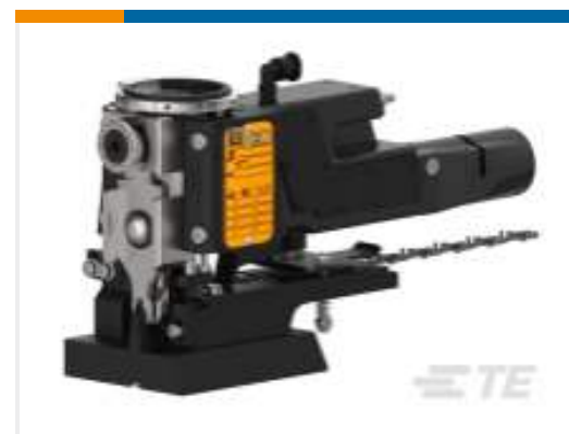
TE Part # 2-2150069-2 OCEAN_2.0_Applicator-E-120F180F