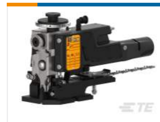
TE Part # 2150069-2 OCEAN_2.0_Applicator-E-120F180F