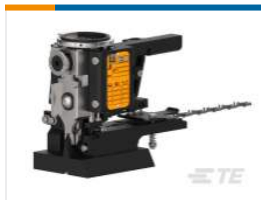
TE Part # 2-2150069-1 OCEAN_2.0_Applicator-E-120F180F