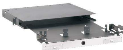
Opticom™ Rack Mount Fiber Enclosures