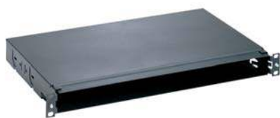
Opticom™ Rack Mount Fiber Trays