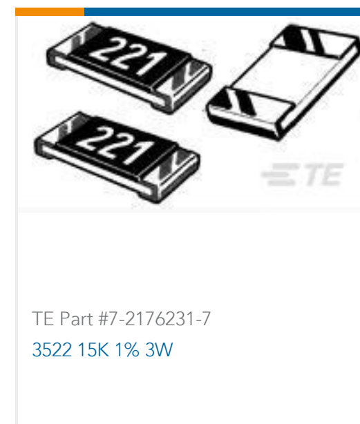
TE Part #7-2176231-7 3522 15K 1% 3W