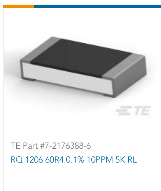
TE Part #7-2176388-6 RQ 1206 60R4 0.1% 10PPM 5K RL