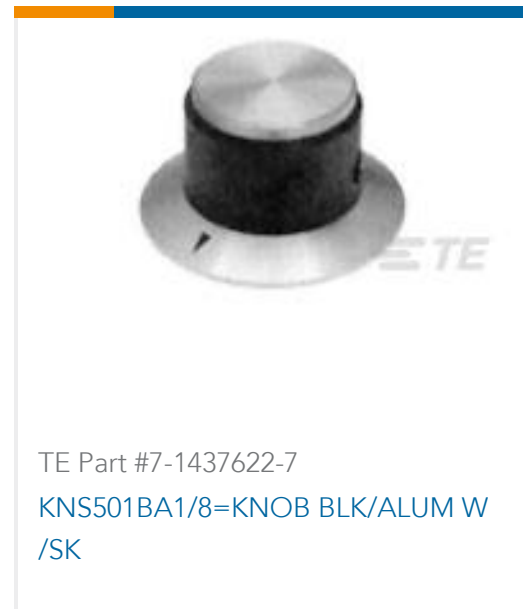
TE Part #7-1437622-7 KNS501BA1/8=KNOB BLK/ALUM W /SK