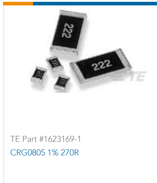
TE Part #1623169-1 CRG0805 1% 270R