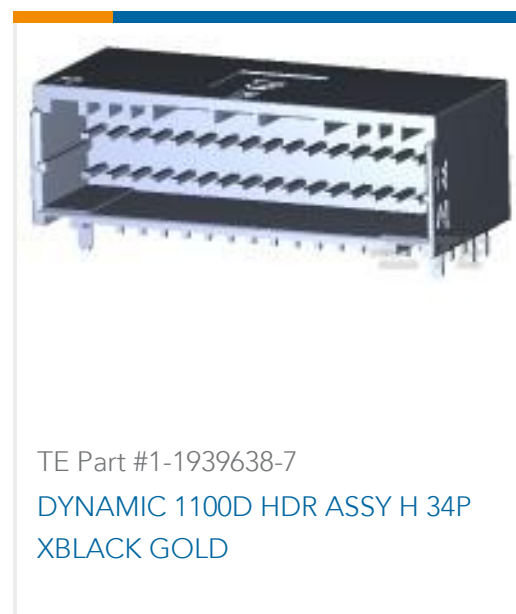
TE Part #1-1939638-7 DYNAMIC 1100D HDR ASSY H 34P XBLACK GOLD