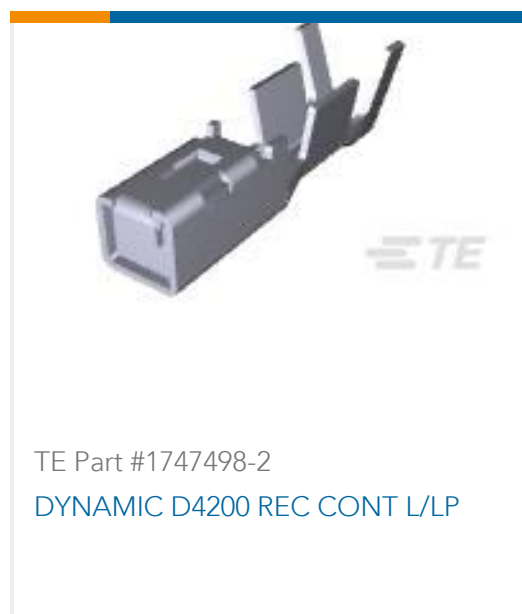
TE Part #1747498-2 DYNAMIC D4200 REC CONT L/LP