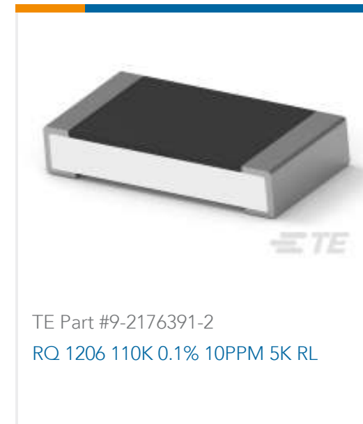
TE Part #9-2176391-2 RQ 1206 110K 0.1% 10PPM 5K RL