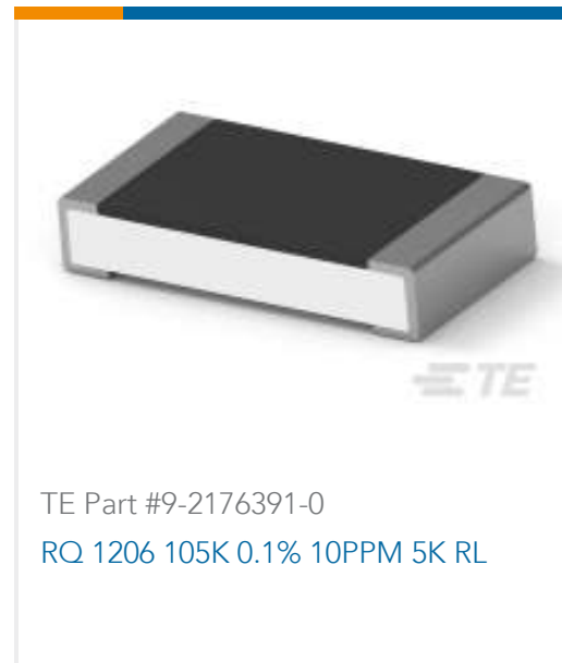
TE Part #9-2176391-0 RQ 1206 105K 0.1% 10PPM 5K RL