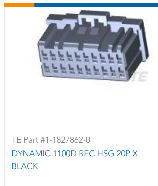
TE Part #1-1827862-0 DYNAMIC 1100D REC HSG 20P X BLACK