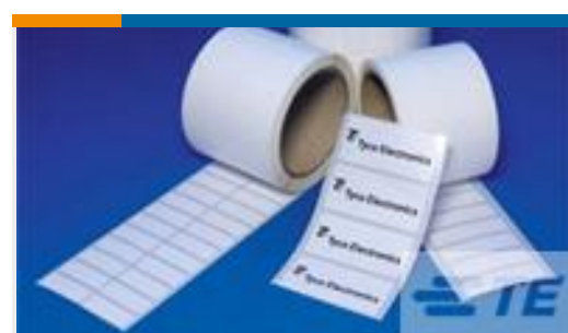
TE Part #6-1768018-3 EET-1938P-9