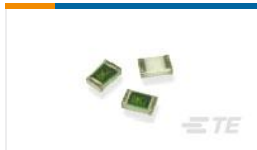
TE Part #1-2176089-9 RP 1J 0.166W 16K9 0.1% 25PPM 1K RL