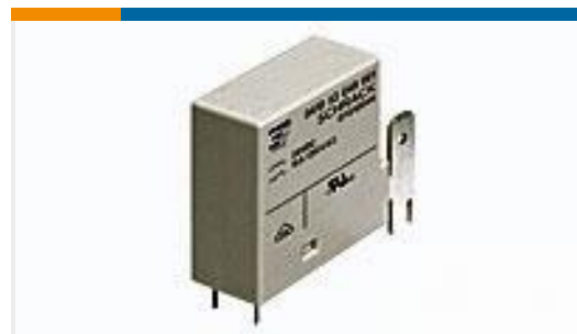
TE Part #8-1415536-6 0410 83 046 001WG