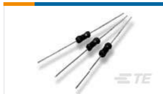
TE Part #5-1625890-2 2W SM M/OX 5% 47K