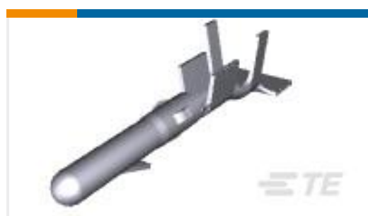
TE Part #350639-1 MNL PIN PTPBR