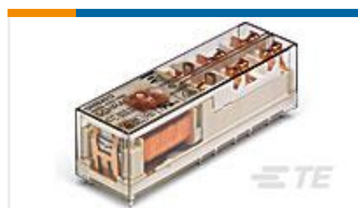
TE Part #6-1415027-1 SR6D4024