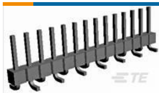
TE Part #5-146128-4 06 MODII HDR SR SFMNT B/A .100