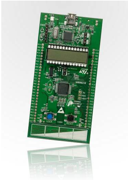
32L152CDISCOVERY top view. Picture is not contractual.