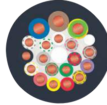
Cable cross section