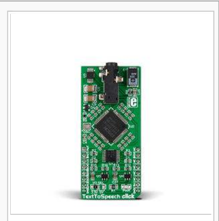
Text To Speech click