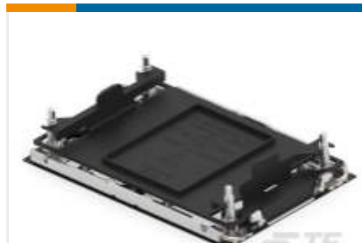
TE Part #2-2351050-5 SOCKET E1 TFLM ASSY,W/ COVER