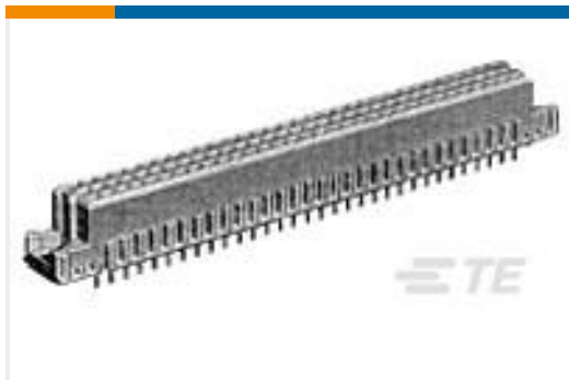
TE Part #5535043-4 ASSY,RECEPTACLE,EUROCARD,TYPE