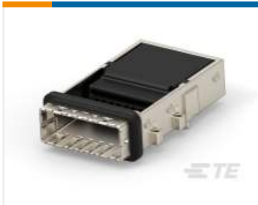
TE Part #2291931-1 CDFP RCPT CONNECTOR & CAGE STYLE 1