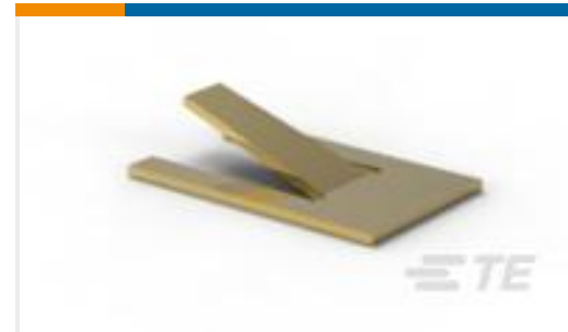
TE Part #1447009-5 SHIELD FINGER 0820 TYPE