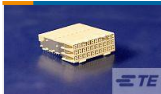
TE Part #2065883-1 Zd Plus, 3 pair receptacle ass