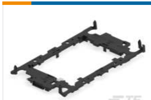
TE Part #1-2351052-5 SOCKET E1, E1A CARRIER ASSY