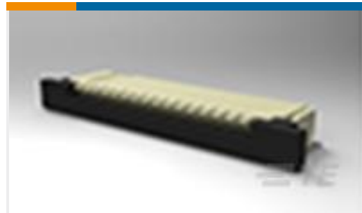
TE Part #2-84953-7 1MM FPC HORZ.TOP CONT.ASSY 27P