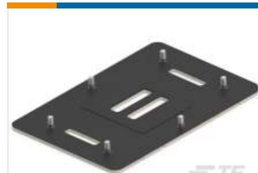
TE Part #2351051-1 SOCKET E1 BACKPLATE ASSY,SHORT STUD