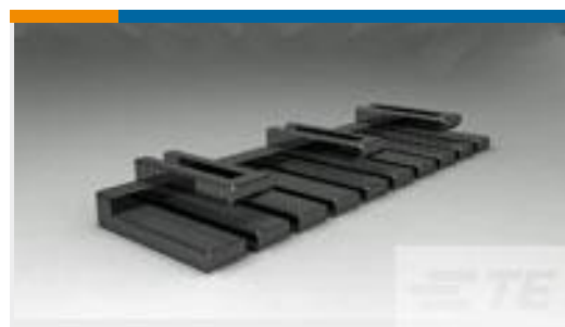
TE Part #1969443-2 EP 2.5 TPA Retainer, 2 Pos