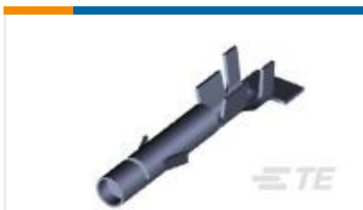
TE Part #926882-1 UMNL SOK 20-14 PTPBR