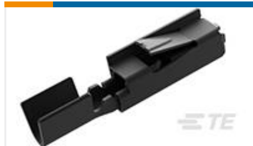
TE Part #1740336-4 MICRO QUADLOK SYSTEM SOCKET CONTACT