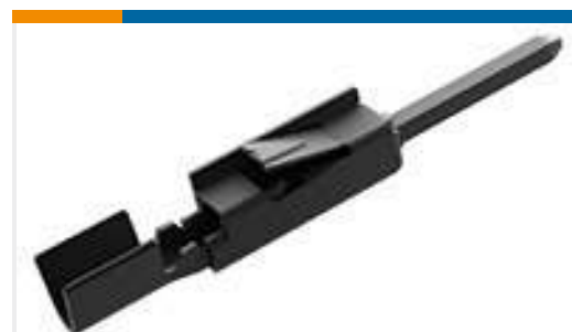
TE Part #1740335-1 MICRO QUADLOK SYSTEM PIN CONTACT