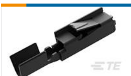
TE Part #1740336-1 MICRO QUADLOK SYSTEM SOCKET CONTACT