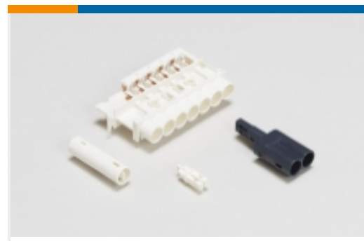
Plug & Socket Lighting Connectors(54)