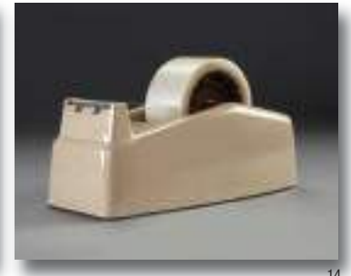
Scotch® Heavy-Duty Tabletop Dispenser C22 for pull and tear convenience.