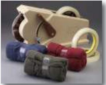
Dispenser M96 dispenses pre-set