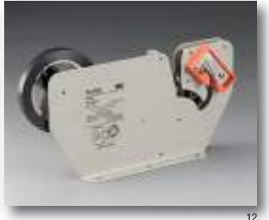
Scotch® Bag Sealer P400 applies tape in an adhesive-to-adhesive flag seal, includes bag trimmer.