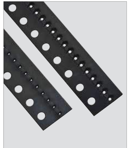
3M™ Polycarbonate Ultra Precision Carrier (UPC) 3000UP

3M carrier 3000UP is designed to provide tight pocket dimensional tolerances of \pm 0.03 mm for A_o , B_o , K_o dimensions and small sidewall draft angles, which allows for better component in pocket fit (part capture) and registration. Additional features consist of a reduced pocket hole (D1) of 0.15 mm to draw vacuum for small component loading applications, combined with flat pocket bottoms, will effectively help reduce component rotation, tilting and flipping concerns for improved throughput.