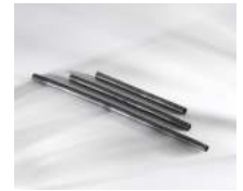
SCT 1 TUBING