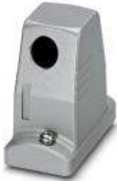
HEAVYCON ADVANCE EMV sleeve housing B10, with screw locking, height 100 mm, with 1xM25 thread, lateral cable outlet

Please be informed that the data shown in this PDF Document is generated from our Online Catalog. Please find the complete data in the user's documentation. Our General Terms of Use for Downloads are valid ( http://download.phoenixcontact.com )