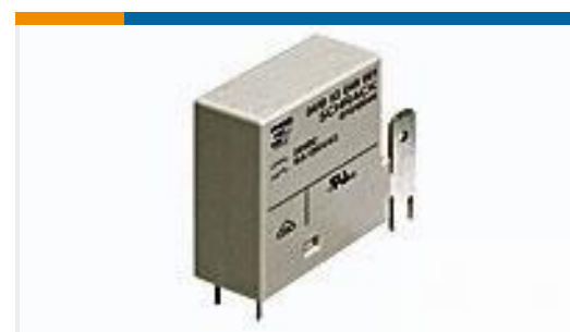
TE Part #8-1415536-6 0410 83 046 001WG