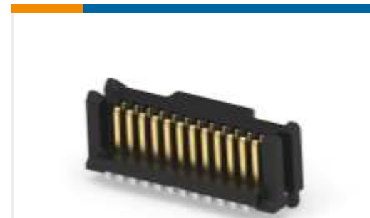
TE Part #114712-E MICROS STV 12 407 188 * 0007 J 3 114712