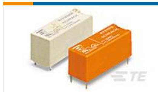
TE Part #4-1956171-2 RY533060R