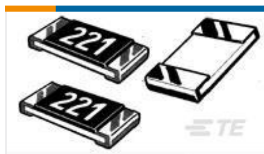
TE Part #1-2176071-8 3521 680K 1% 2W