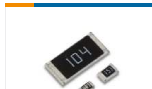
TE Part #3-2176349-5 CRGCO 2512 6K8 1%