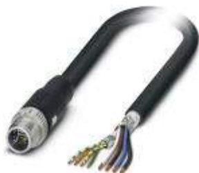
Assembled Ethernet cable, CAT5e, shielded, 8-wire, 4 x 26 AWG (data) and 4 x 20 AWG (power), RAL 9005 (black), M12 hybrid plug to free cable end, length: 15.0 m

Please be informed that the data shown in this PDF Document is generated from our Online Catalog. Please find the complete data in the user's documentation. Our General Terms of Use for Downloads are valid ( http://download.phoenixcontact.com )