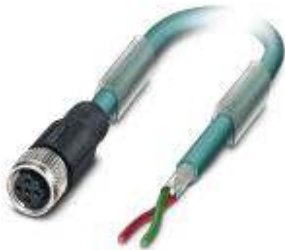
Bus system cable, PROFIBUS, 2-position, PUR/PVC, blue, shielded, free cable end, on Socket straight M12, B-coded, Cable length: 5 m

Please be informed that the data shown in this PDF Document is generated from our Online Catalog. Please find the complete data in the user's documentation. Our General Terms of Use for Downloads are valid ( http://phoenixcontact.com/download )