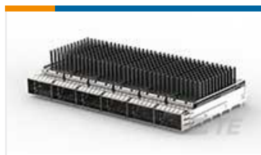
TE Part #2170707-3 CAGE ASSY, 1X6, QSFP28, SPRING, HS