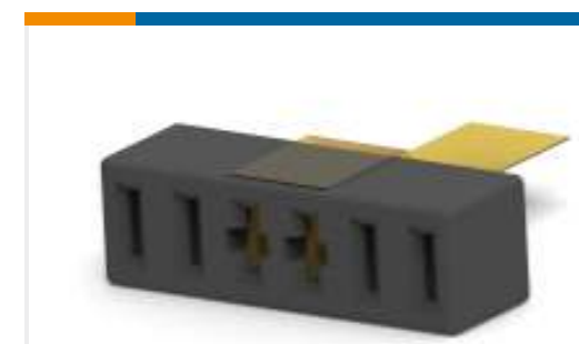
TE Part #1926303-1 Cover Connector, FLATPAQ