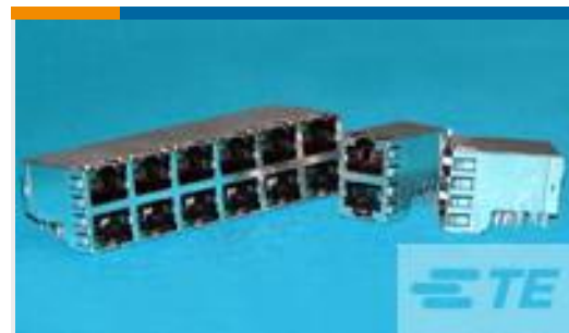
TE Part #6368062-8 2X4 OFFSET STK MJ,SHLD,W/LED