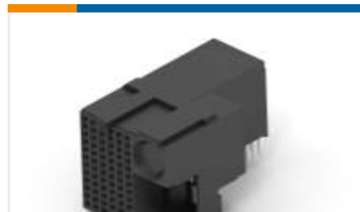
TE Part #1645570-1 12 ROW HM RA REC ASY 072P RGHT