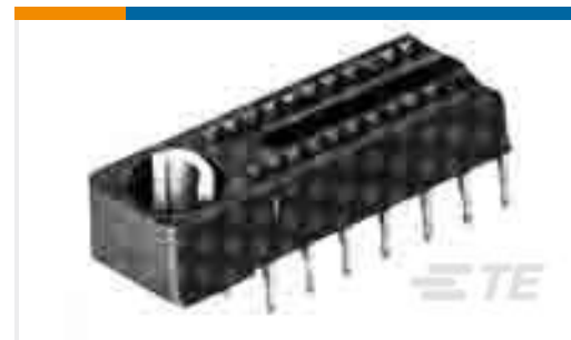
TE Part #530720-2 MINI BX-RCPT ASSY 50 POS