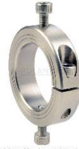
*Additional hardware #01 included