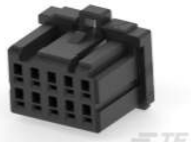
TE Part #1-1827864-2 Receptacle and Tab Housing: 2.5 mm Pitch, 250V