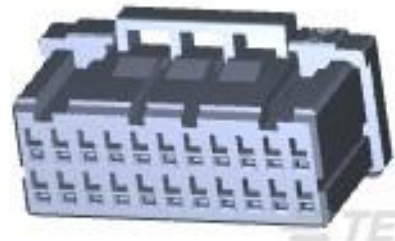
TE Part #1-1827863-1 DYNAMIC 1100D REC HSG 22P X BLACK