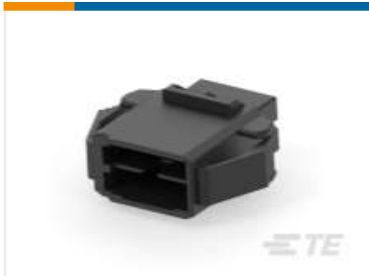
TE Part # CAT-D9934-A15C Receptacle and Tab Housing: 3.5 mm pitch, 250V