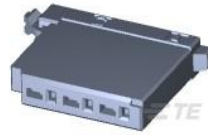
TE Part #1-1827579-1 DYNAMIC 1500T REC HSG 3P X BLACK