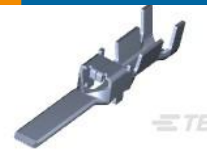
TE Part #1747419-2 DYNAMIC D4200 TAB CONT M