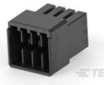
TE Part #1-2040444-4 DYNAMIC 1500T TAB HSG 12PX F/H