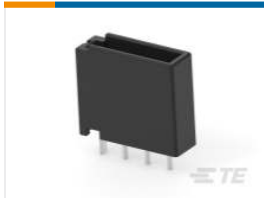
TE Part # CAT-D9934-A15G Header Assembly: Wire-to-Board, 5A, Gold Plated