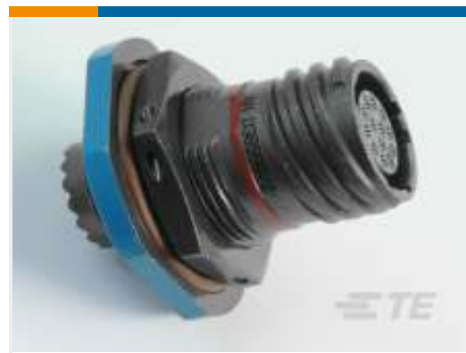
TE Part #YDTS24G15-19SAV001 D38999: Jam Nut, 15-19 Insert