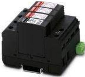
Surge arrester consisting of base element with remote indicator contact and ground connectors, for mounting on NS 35/7.5, nominal voltage: 120 V AC, 3 + 1 circuit

Please be informed that the data shown in this PDF Document is generated from our Online Catalog. Please find the complete data in the user's documentation. Our General Terms of Use for Downloads are valid ( http://download.phoenixcontact.com )