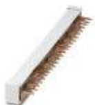
Wiring bridge for modules with connecting pitch 17.5 mm, 4-phase, 12-pos.