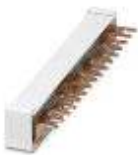
Wiring bridge for modules with connecting pitch 17.5 mm, 4-phase, 8-pos.