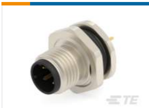
TE Part #T4140512041-000 M12,REAR MOUNTING,MALE,D CODE,4P