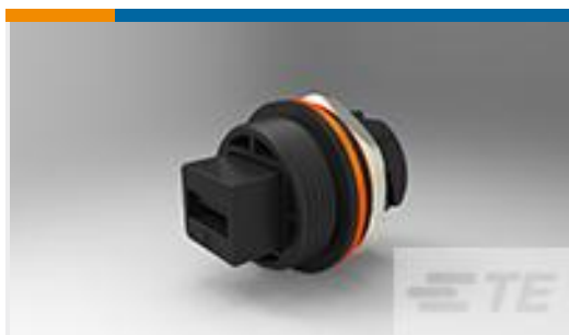
TE Part #1954646-1 Recept Kit, Series B to A