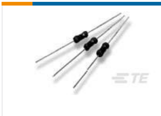
TE Part #3-1879354-9 RR03 5% 12R AMMO