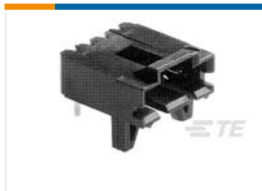
TE Part #5-103672-3 04 MTE HDR SRRRA LATCH W/HLDWN