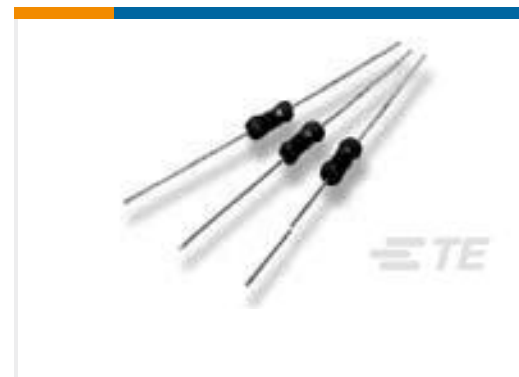
TE Part #8-1879352-7 RR02 5% 1K2 AMMO