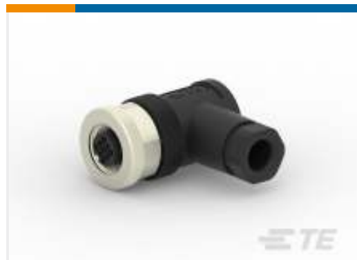
TE Part #T4112001021-000 M12,FEMALE,RA,A CODE,2P,PG7, GOLD