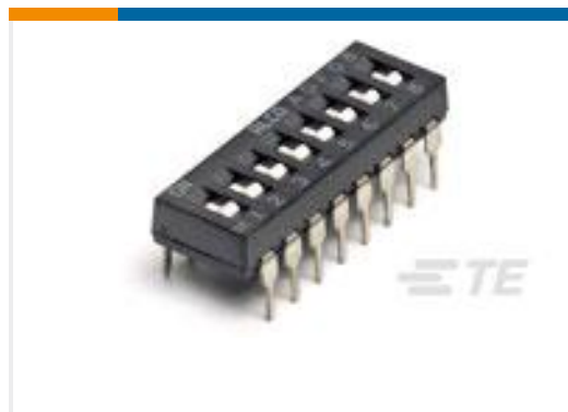
TE Part #2-1825059-3 ADF05ST04=DIP SWT,FLUSH,SMT-GW