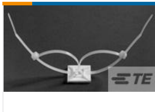
TE Part #608801-1 CABLE TIE MOUNT, 2-WAY