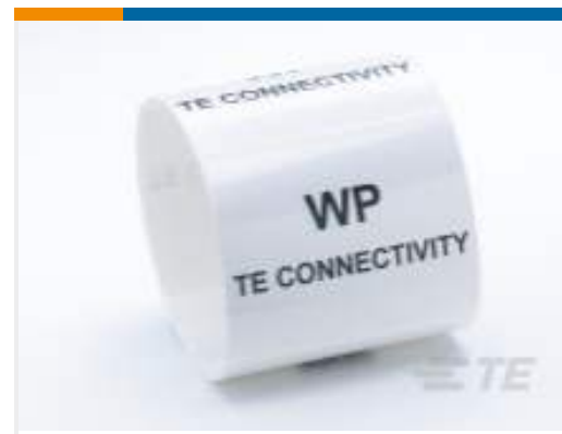
TE Part #C11336-000 WP White Polyester Labels