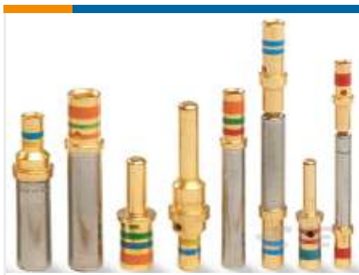
TE Part #2560-201-2031L CONT PIN