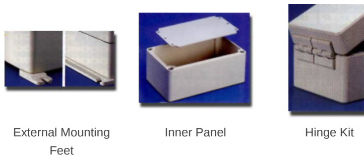
External Mounting Feet