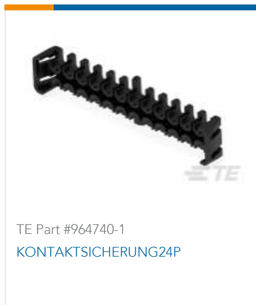
TE Part #964740-1 KONTAKTSICHERUNG24P