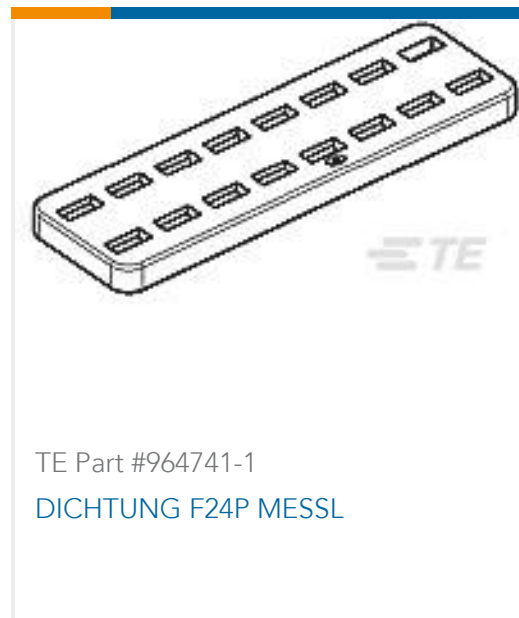
TE Part #964741-1 DICHTUNG F24P MESSL