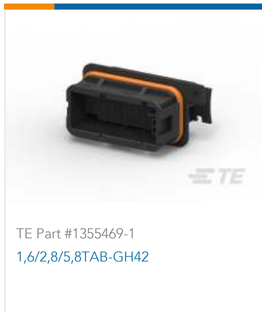
TE Part #1355469-1 1,6/2,8/5,8TAB-GH42