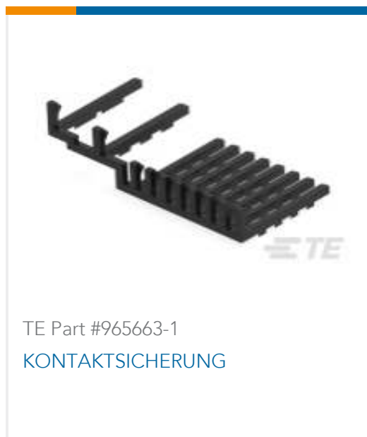
TE Part #965663-1 KONTAKTSICHERUNG