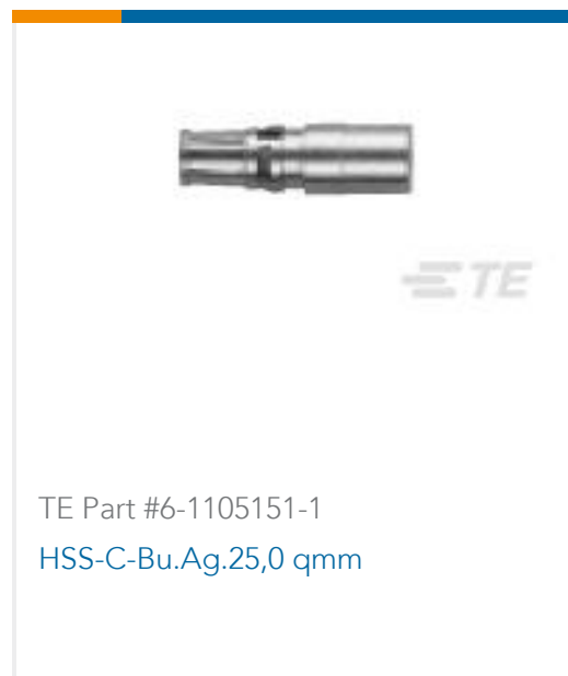
TE Part #6-1105151-1 HSS-C-Bu.Ag.25,0 qmm