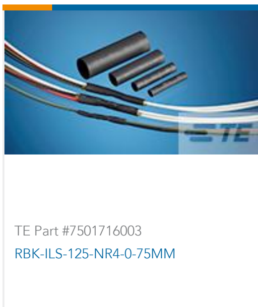
TE Part #7501716003 RBK-ILS-125-NR4-0-75MM