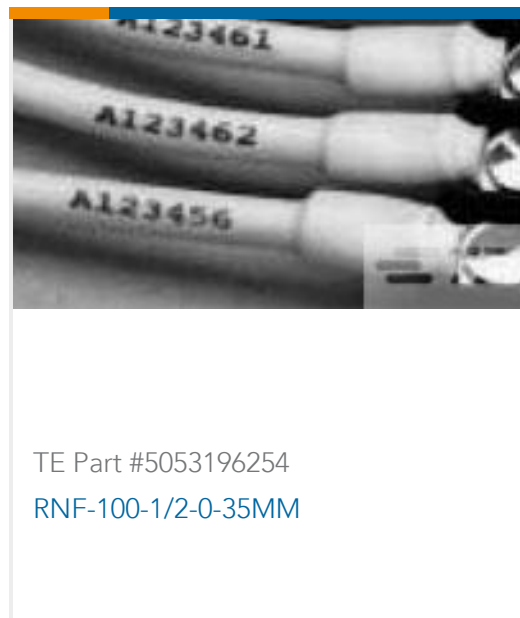
TE Part #5053196254 RNF-100-1/2-0-35MM