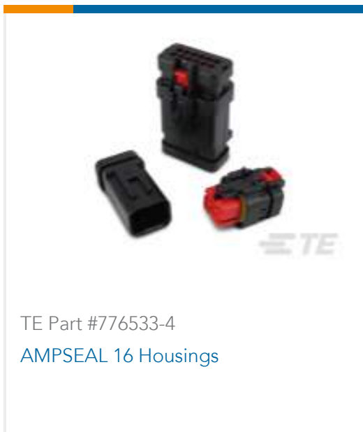
TE Part #776533-4 AMPSEAL 16 Housings