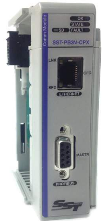
SST™-PB3M-CPX PROFIBUS* Master Module