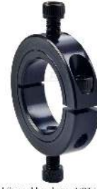
*Additional hardware #01 included