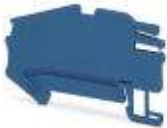
Support bracket, Bracket for busbars, set every 20 cm, Length: 67 mm, Width: 2 mm, Height: 43 mm, Color: blue