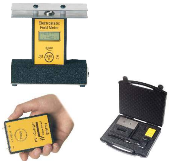
EFM51.CPS Charge Plate Kit

This document is prepared for our customers as a service, and is to the best of our knowledge true and accurate. However, it is understood and agreed by the users of this document that we will accept no liability for the conclusions reached. Users of this document may therefore wish to perform additional testing before determining that products mentioned are suitable.