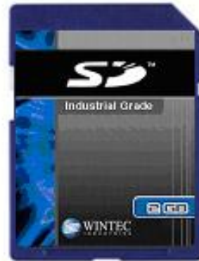
Wintec Secure Digital Card

Wintec Secure Digital Cards employ a variety of sophisticated error checking and flash management utilities allowing for maximum levels of data reliability and card endurance. Patented wear-leveling methods ensure even wear of flash blocks across the entire card capacity. Background operations track erase counts, prioritize new writes to blocks with lower wear, and relocate static data to blocks with higher wear. Bad-block Management routines replace worn