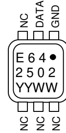
TOP VIEW THE DOT MARKS PIN 1

YYWW = DATE CODE RR = DIE REVISION CODE CCCCC = COUNTRY CODE