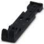
Strain relief, Number of positions: 2, Color: black