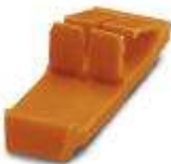
Latching, Number of positions: 2, Color: orange