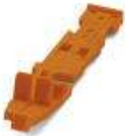
Latching, Width: 5.2 mm, Length: 3 mm, Number of positions: 2, Color: orange