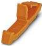
Latching, Number of positions: 1, Color: orange