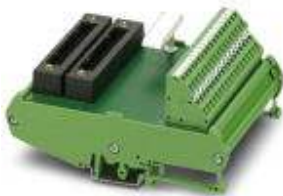
The figure shows the version with spring-cage connection

Please be informed that the data shown in this PDF Document is generated from our Online Catalog. Please find the complete data in the user's documentation. Our General Terms of Use for Downloads are valid ( http://phoenixcontact.com/download )